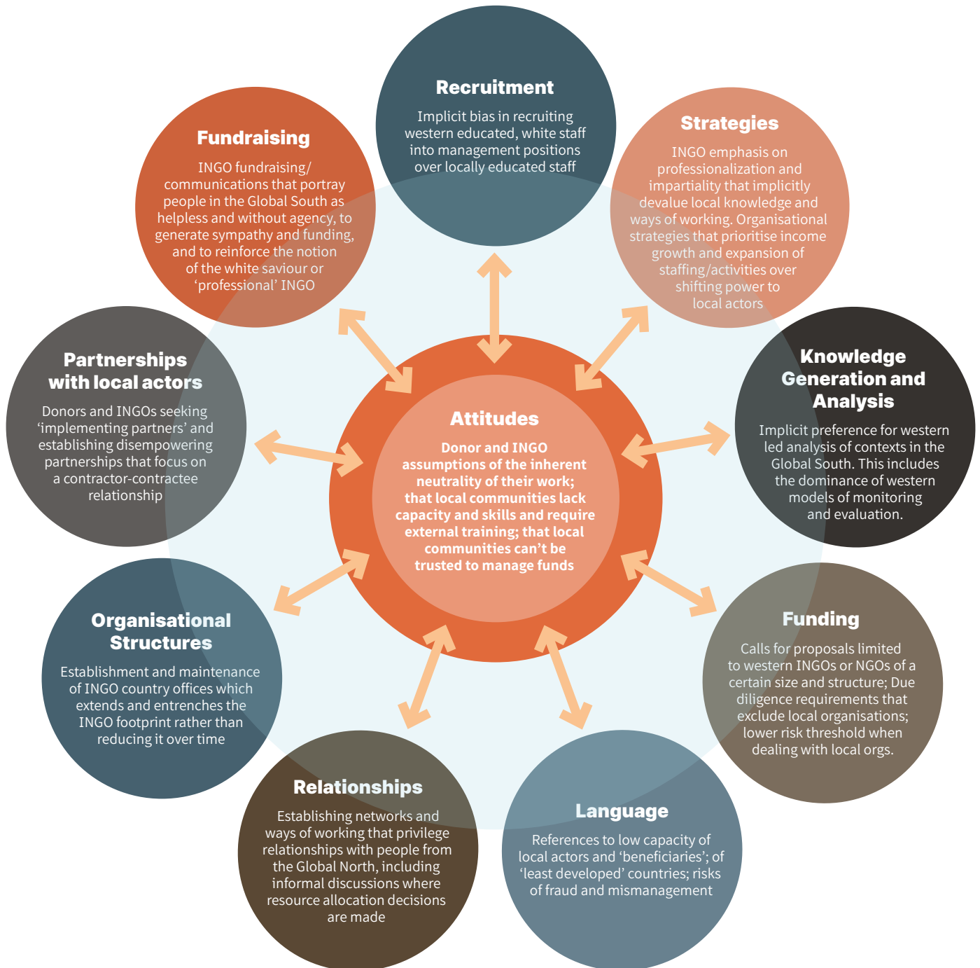
Diagram How structural racism shows up in the sector