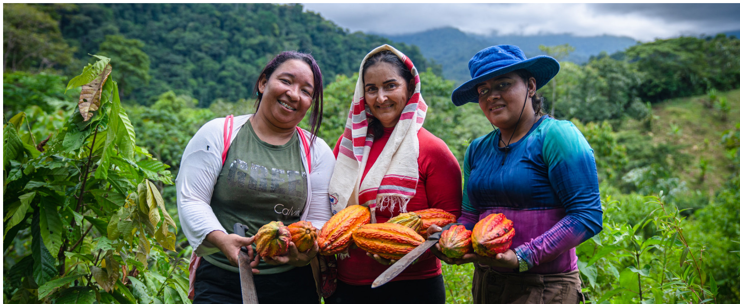
Women FARC ex-combatants in San Jose de Leon, Colombia, are leading economic projects like cacao fields to sustain their families and contribute to the entire community, as they reintegrate into civilian life.

The U.S. Government should instead lead with narratives that women and girls are agents for peace, and therefore part of the solution to the global violent conflict problem. When violent conflicts flare, for example, the U.S. Government should show how women peacebuilders are working on the frontlines of humanitarian response and community peace processes . On GFA implementation, the U.S. Government should constantly emphasize the law could be revolutionary to U.S. foreign policy and assistance and an unprecedented solution to global