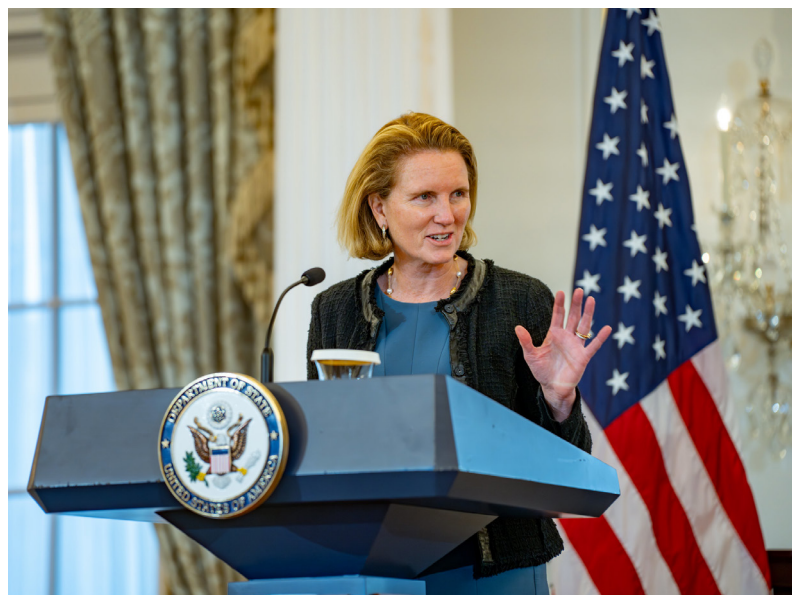
USAID Deputy Administrator Isobel Coleman at the launch of the 2023 U.S. Strategy and National Action Plan on Women, Peace and Security (WPS).

By applying the following reframing narrative recommendations, we can build more robust support both within the government and with the public to effectively make the case for what peacebuilding is and why it must be centered, integrated, and robustly resourced in strategies, policies, and laws.