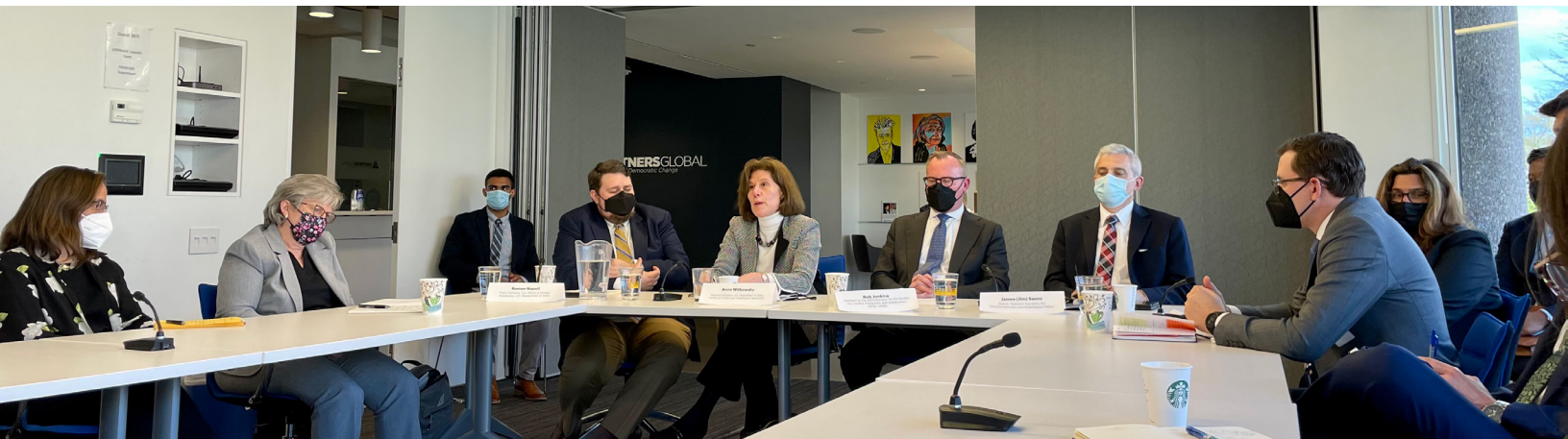
AfP and Mercy Corps co-lead the GFA Coalition—a non-partisan coalition of more than 100 organizations that work closely with Congress and the Administration to ensure successful implementation of the GFA.