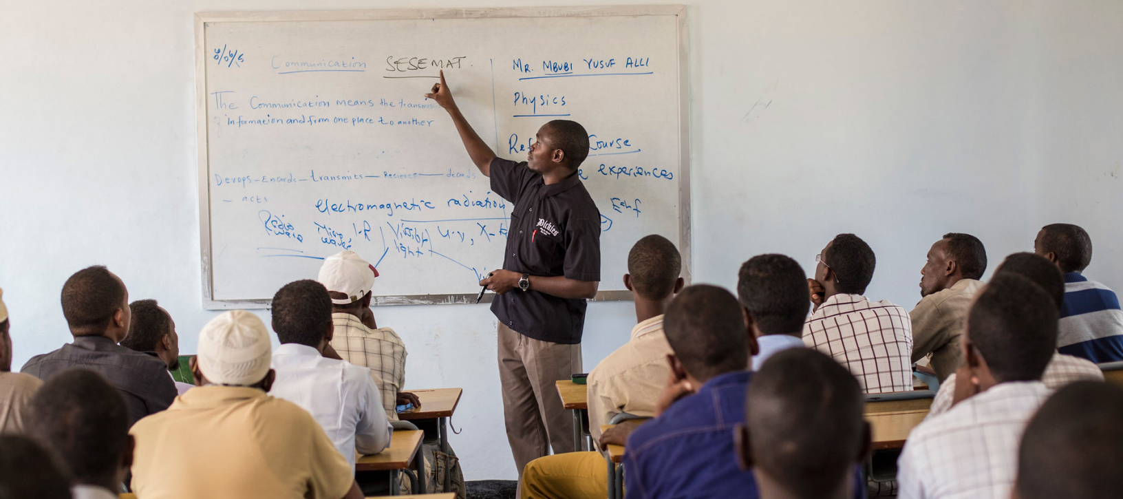
Somali Youth Learners Initiative Teacher Training.

Focusing on programs instead of individual heroes attributes the success of peacebuilding interventions to solutions that anyone can be a part of, instead of attributing success to the unique, outstanding qualities of one particular person in one particular context.