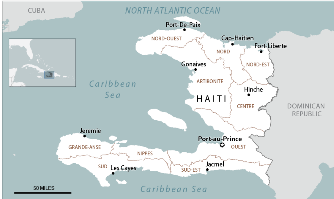
Figure I. Map of Haiti